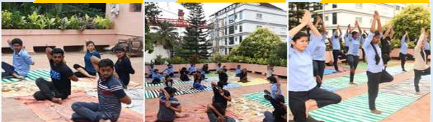
International Yoga day celebration by MI students