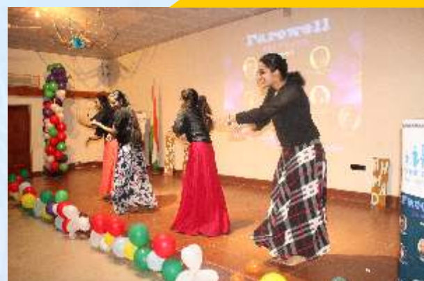
Farewell celebrations to 7th Batch BPO students by juniors