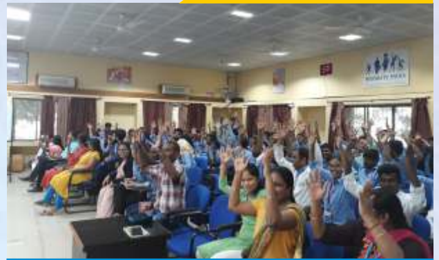
MI training staff and students learning sign language interaction

To facilitate easy communication with MI students with speech and hearing, a sign language workshop was conducted for teachers and students of Mobility India which paves way to promote inclusion, integration and healthy relationship.