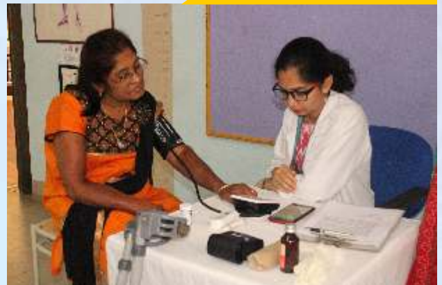
Health Screening Programme