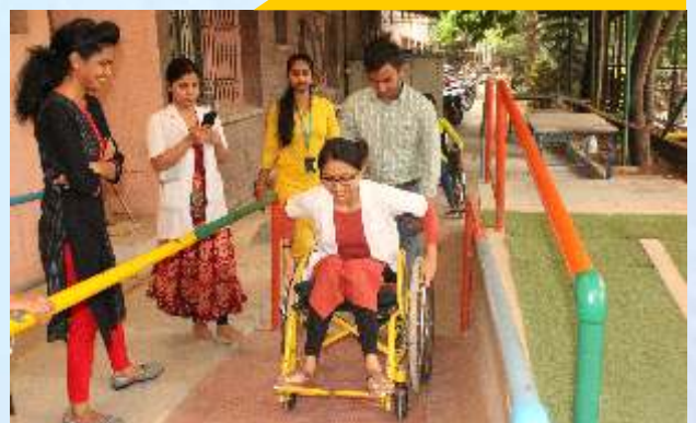
Wheelchair skills training to physiotherapy students

➤ Workshop on Introduction to Prosthetics and Orthotics: A one-day workshop was conducted on 26th July 2019 for 3rd year Bachelor in Physiotherapy students of St. John's College of Physiotherapy.