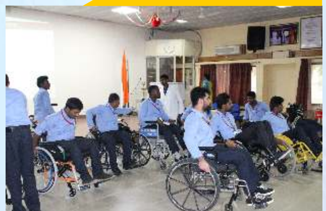
Wheelchair hands-on practical session during WSTP-B course to students

It is high time that healthcare profession aspirants should obtain additional training and qualification to increase their job prospects. Mobility India is the only institution who has put in a lot of effort to integrate the Wheelchair Service Training Programme (WSTP) in regular curriculum based on the WHO guidelines. This course helps them to be equipped with knowledge and skills to provide appropriate manual wheelchair for people in need, following WHO standards.