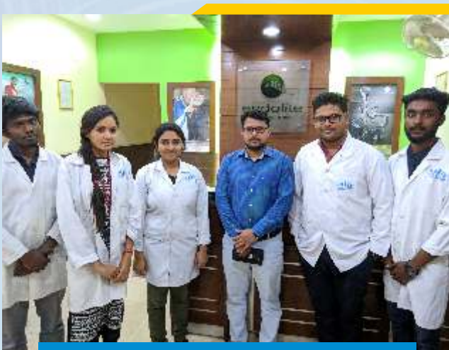
BPO Interns during visit to Endolite India Pvt. Ltd., New Delhi