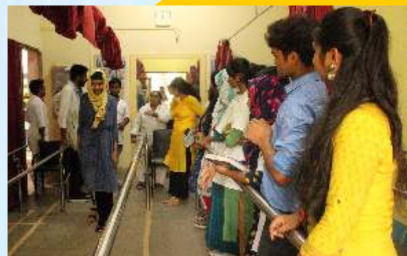
A glimpse of facilities tour for different physiotherapy colleges.