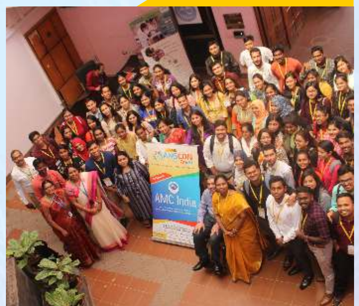
Pre-conference workshop at Mobility India: Group photo of participants