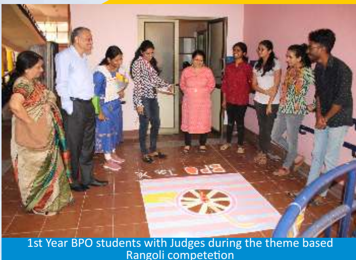
1st Year BPO students with Judges during the theme based Rangoli competition

The cultural event was conducted from 11th to 13th March 2020. Experts from respective fields were invited as judges for the events.