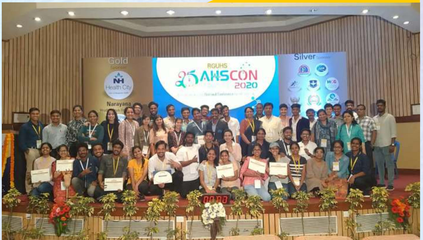
Participants of Mobility India at AHSCON-2020