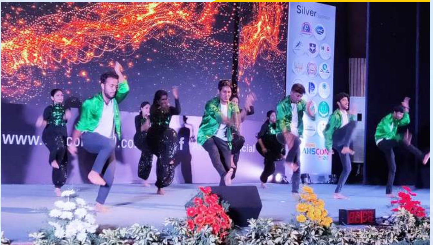
Mobility India students bagged 2 nd prize for Free style dance during the cultural programme at AHSCON 2020.