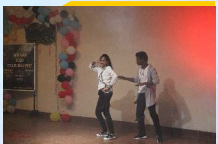
Our Long term course students performing in group dance. Both the students are speech and hearing disabled.