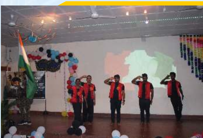
BPO Internship students during patriotism based group dance