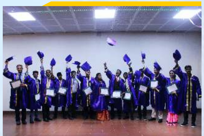
Graduation day Celebration-December 2019

In the year 2019, overall students graduated are 10 Orthopaedic Technologists, 3 Lower Limb Orthotics Technologists, 3 Lower Limb Prosthetics Technologists, 7 Rehabilitation Therapy Assistants and 7 Bachelor in Prosthetics and Orthotics students.