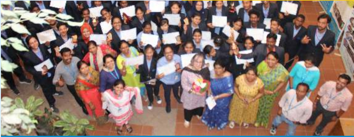
Winners of sports events