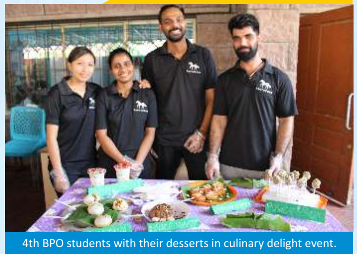
4th BPO students with their desserts in culinary delight event.