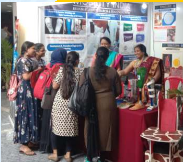
Creating awareness to participants about various P&O components at Mobility Stall during AHSCON-2020