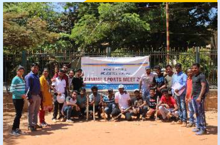
A glimpse of Outdoor sports