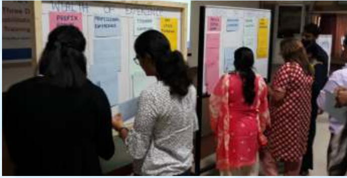
Participants during one of the activities at CRE workshop