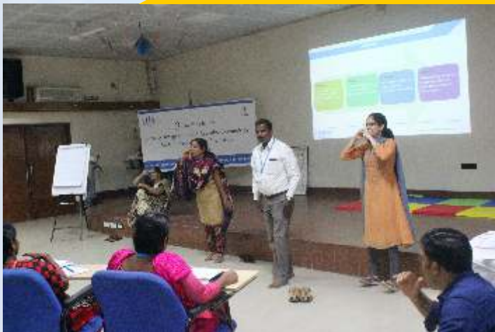
Participants during one of the activities during workshop

This workshop focussed on postural management and sensory integration as an integral part of the functional development of children in need.