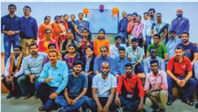
Teachers and students come together for a group picture during Teachers day celebrations.